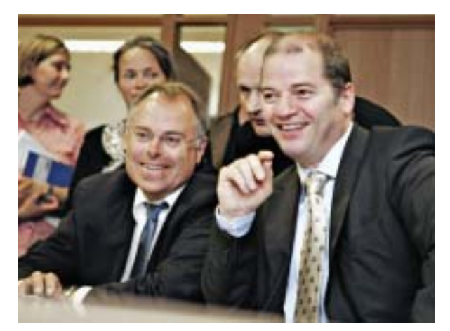
Government recognition: Sta'le Johansen of emgs explains seabed logging to The Norwegian Petroleum and Energy Minister, Odd Roger Enoksen (right), during a recent visit to the company's headquarters in Trondheim, Norway

Seismic surveying is a well developed art and has proved highly effective at locating the kind of structures that might be expected to contain hydrocarbons. The drawback of the