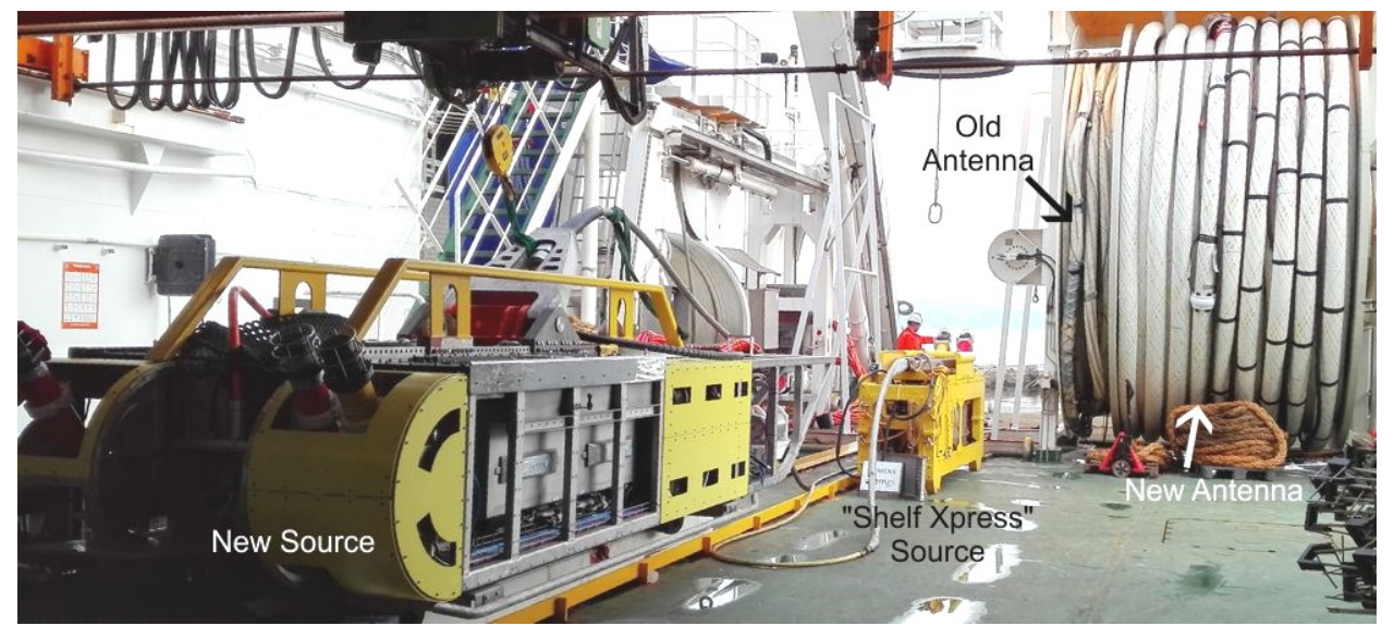
Figure 1: New antenna and new source on the Atlantic Guardian next to old antenna and the conventional sub-surface source during the field tests.