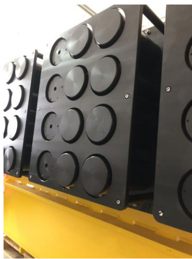
Figure: IGBT A Module

The first new 6<sup>th</sup> generation source system, Tx-D 5006, will replace the Conventional Source as a backup for the Deep Blue (Tx-D 10005) and will be capable of transmitting up to 5000 ampere.